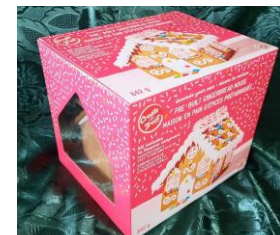
Pre-Assembled Gingerbread house