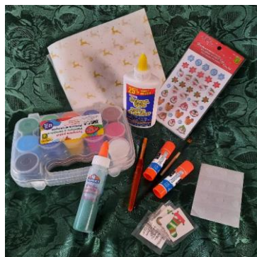
Craft Supplies Kit