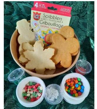
Cookie Decorating Kit