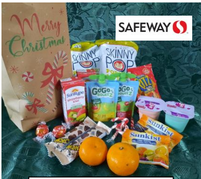
Snacks from Safeway