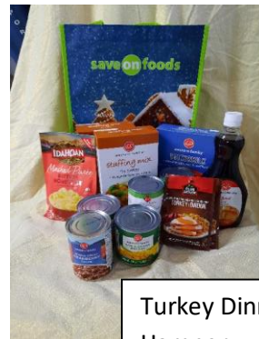
Turkey Dinner Hamper