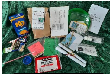
Sprott Shaw Lunch with Santa Package