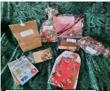
Crafts for families to complete!

We hope everyone enjoyed their package, and had a great holiday season.